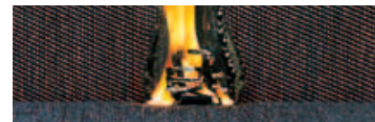
For the contract fabric sector, the prescribed tests use different ignition sources - like this one with a burning crib on top of the furniture upholstery (BS 5852 Part 2, crib 5).