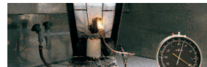
In France, textiles must pass test NF P 92501, the "Brûleur électrique", one of the most stringent burning tests in the world.